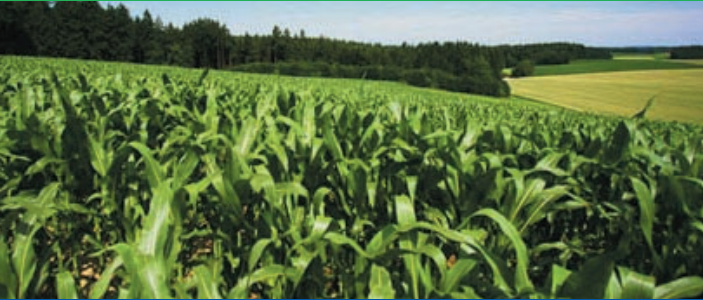
AgrAbility Provides Solutions.