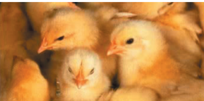
AgrAbility Removes Barriers through Assistive Technology.

Assistive Technology on the farm can be: