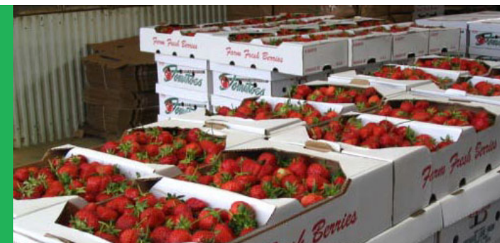
AgrAbility Can Preserve Your Way of Life.