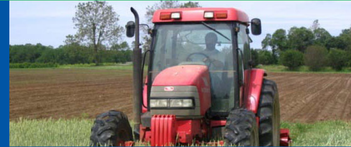
AgrAbility is About No Limit Thinking.

Are your physical limitations and health conditions preventing you from leading a productive life in agriculture?